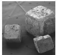
ENLARGED TABLE SALT CRYSTAL